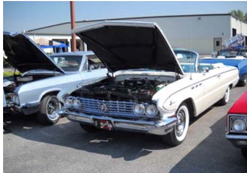
Best Of Show 1961 LeSabre Convertible