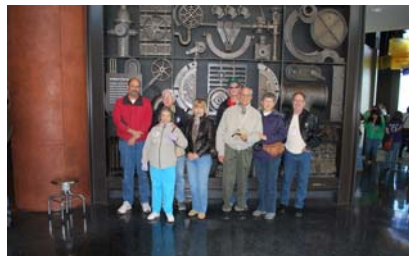
Vulcan Park. Part of the Dixie contingent in front of a sculpture depicting Birmingham's contribution to the production of Iron and Steel.