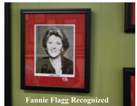
Fannie Flagg Recognized