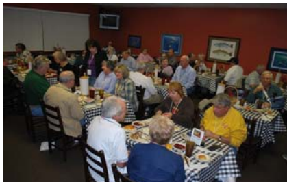
Lunch at Irondale Cafe