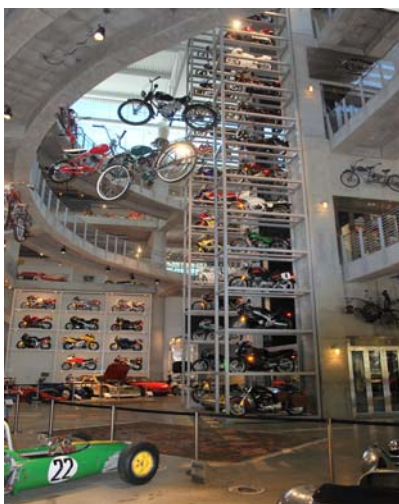
Barber Motorcycle Museum

Birmingham was big in supplying iron for guns, and Iron Clad Ships during the Civil War. Three furnaces were restored at Tannehill Ironworks, and one produced a small amount of iron for the 1977 US Bicentennial. Vulcan Park, in downtown Birmingham, memorializes the contribution Birmingham made during the great iron and steel age. The center point is a colossal statue of Vulcan (god of Iron and steel), which was part of the 1904, St. Louis Worlds Fair. Having been cast in Birmingham it was brought back to Birmingham and is the world's largest cast iron statue and considered one of the most memorable works of civic art in the United States.