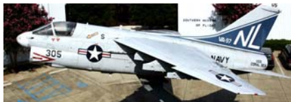
Southern Museum of Flight

Having served in the Navy, and in Naval Aviation, a stop at the Southern Museum of Flight brought back proud memories. The Museum contained exhibits illustrating flight from the earliest attempts at flight up to some of the most current aircraft. Especially exhilarating to me was finding a plane on display (pictured below) that had belonged to the Air Group I was part of during my Navy years. With a unexpectedly large collection, the museum rivals those in much larger cities; an assembly of which Alabama should be proud.