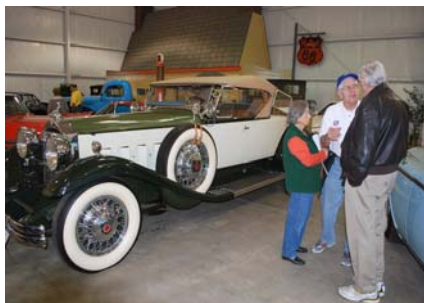
V12 Packard. Private Collection

models of vehicles. Some there only because they hold fond memories for either the owner or for his wife; others are rare, meticulously restored, and with a history of their own. For several it was obvious the cost of restoration not limited, and were deserving of their many National awards.