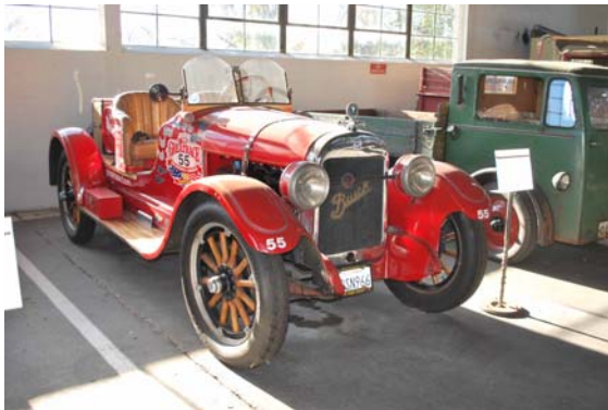
1922 Buick Speedster Lane Motor Museum