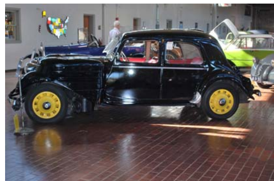
1938 Citroen - modified during WWII to burn coal to create methane gas for combustion. Coal burner in front fenders