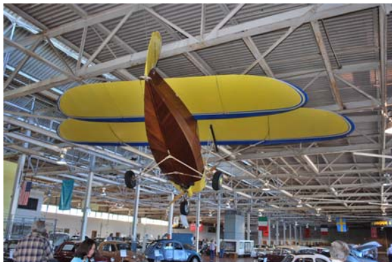
Lane Motor Museum