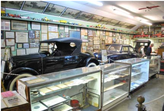
The Garland King Museum - a bit of everything