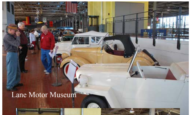
Lane Motor Museum