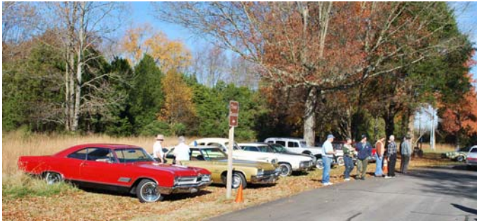
Buicks at Stone River Battlefield