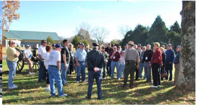
US Forest Ranger (center right) describes the decisive battle that took place at Stone River