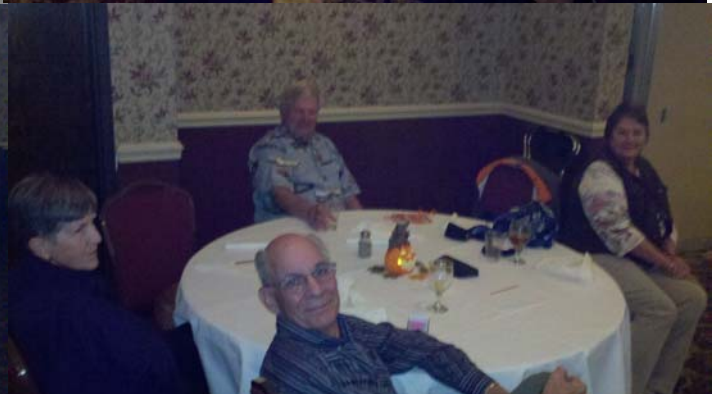
Photos are: On the Blue Ridge Parkway; the Virginia International Raceway; and the Banquet.