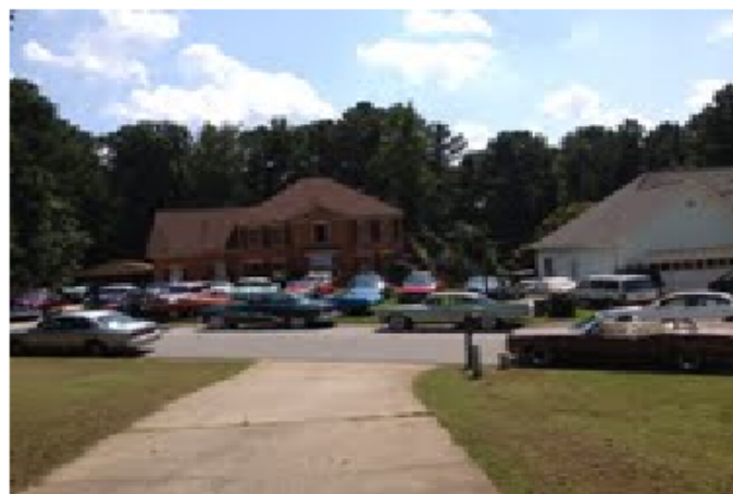
Annual Dixie Chapter Picnic pix on pg. 3