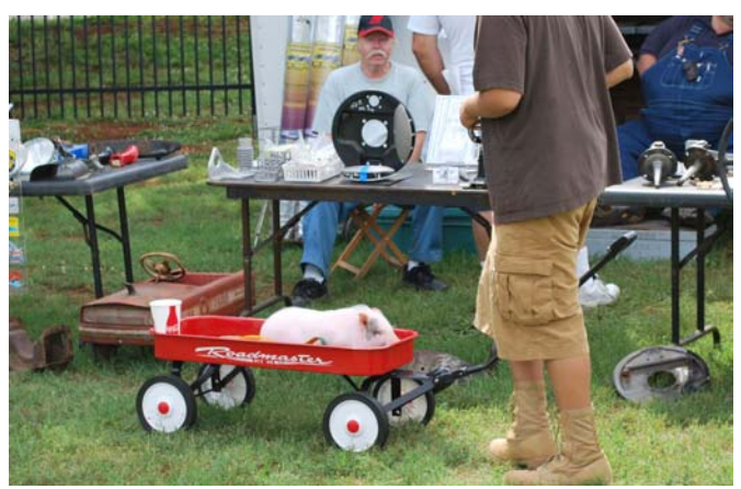
"Bacon", a Vietnamese Pot-belly pig enjoyed the day riding in a "Roadmaster", having his head robbed, and munching on handouts from show participants.