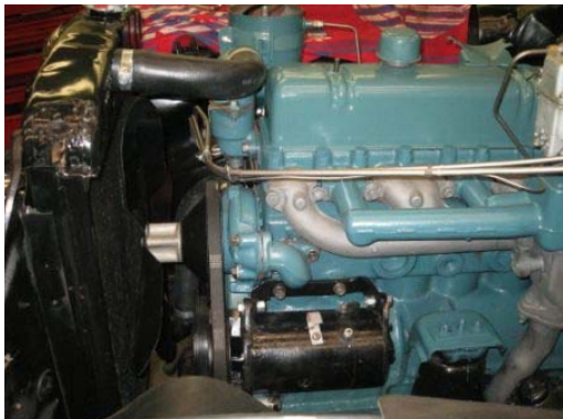
Harmonic balancer installed in Illinois