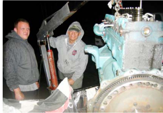
Back home, engine removed for re-build