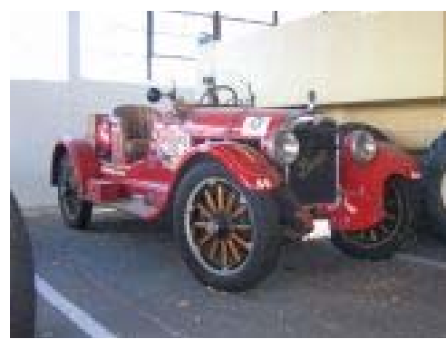
1922 Buick Speedster

Visitors can see a broad variety of vehicles from Europe,