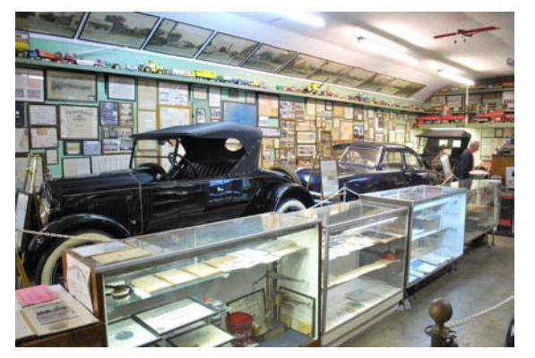
The Garland King Museum - a bit of everything