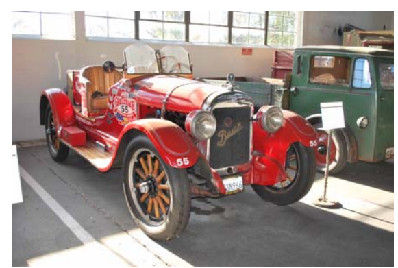
1922 Buick Speedster Lane Motor Museum