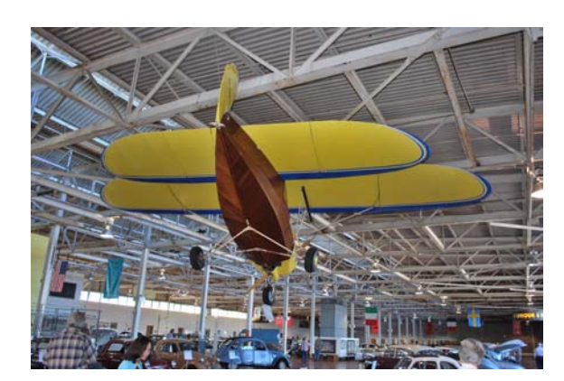
Lane Motor Museum