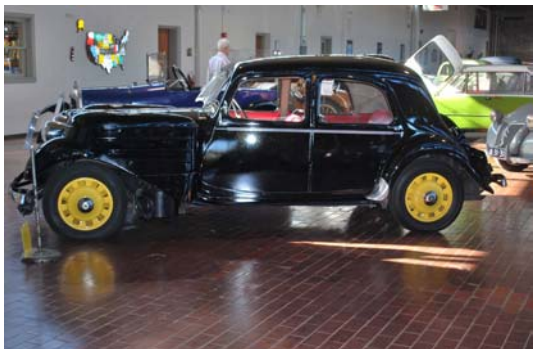
1938 Citroen - modified during WWII to burn coal to create methane gas for combustion. Coal burner in front fenders