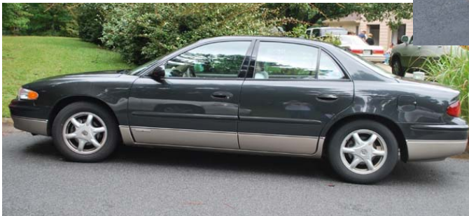
2003 Regal Bruce & Shar Kile