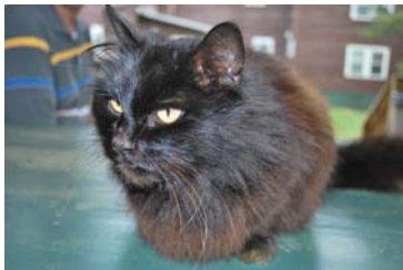
Inky the cat, greeter at Mentone Inn.