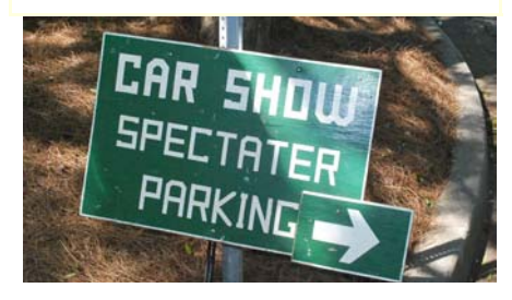
Parking Directions Southern Style