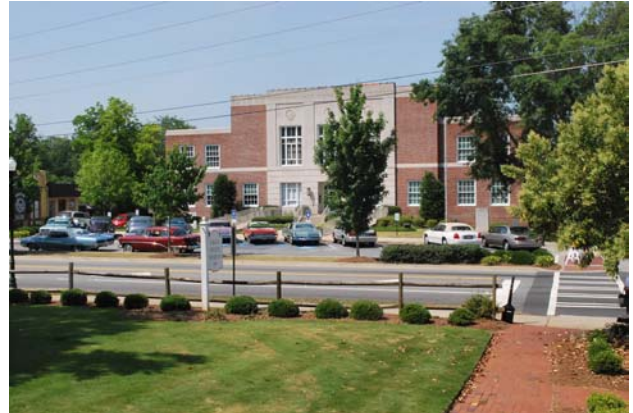
Oconee County Court House, Watkinsville, GA