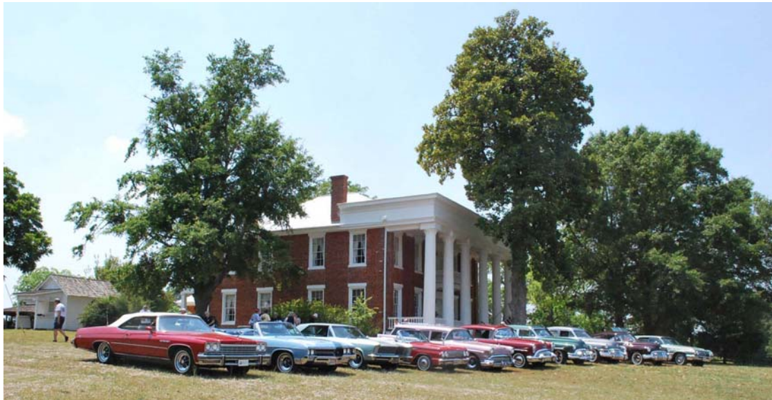
Buicks arrive at the Calloway Mansion in Washington, GA