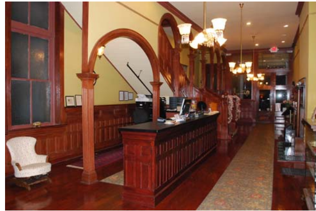
Overnight accommodations were at the Fitzpatrick, an elegant Victorian hotel built in 1898. After renovation in 2004 it re-opened with all the modern amenities, yet preserved a glimpse of times past.