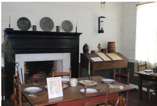
The Eagle Tavern has been restored to depict life for the early traveler in the pre-Civil War, pre-railroad era, when wagon and stage travel was at its height.