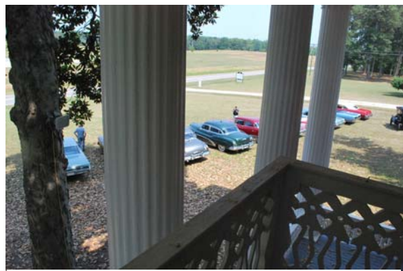
Buicks seen from front balcony