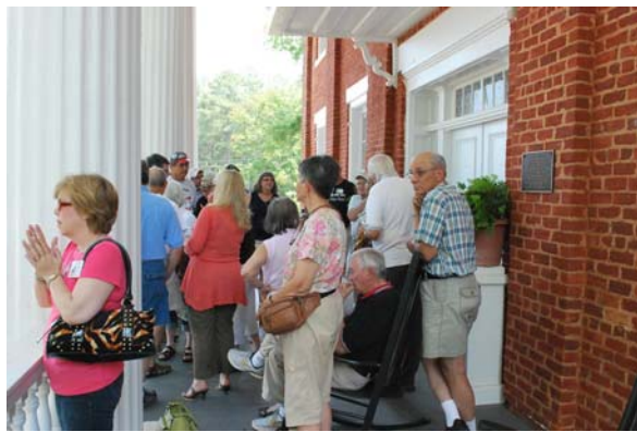
Waiting for the opening