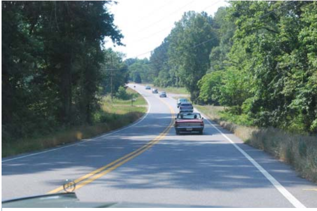
Motoring across Georgia's scenic country roads