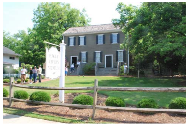
The early 1800's Eagle Tavern, which also functioned as a hotel is now a museum.