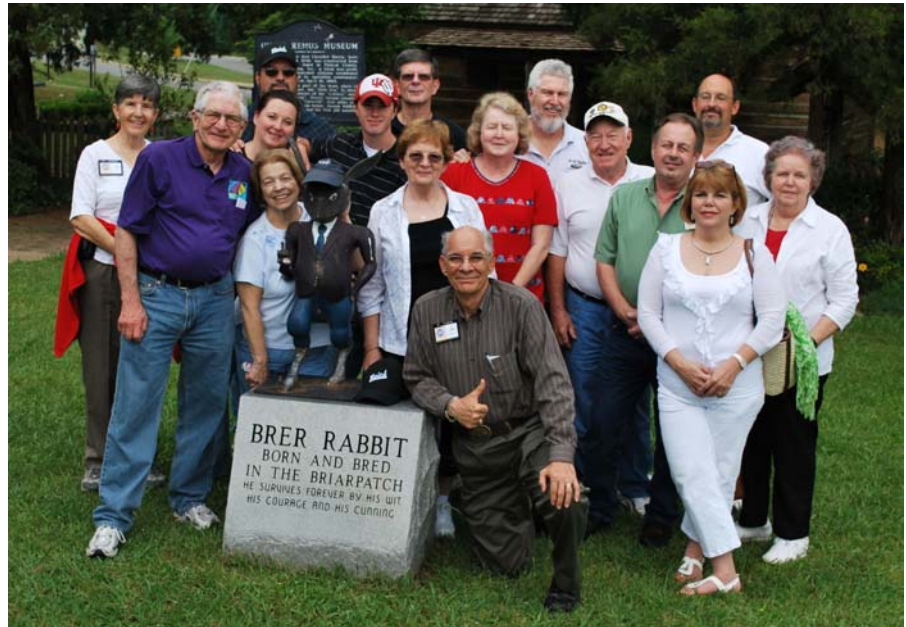
Dixie Chapter members gather around the statue of Br'er Rabbit during the 2009 "Overnighter".