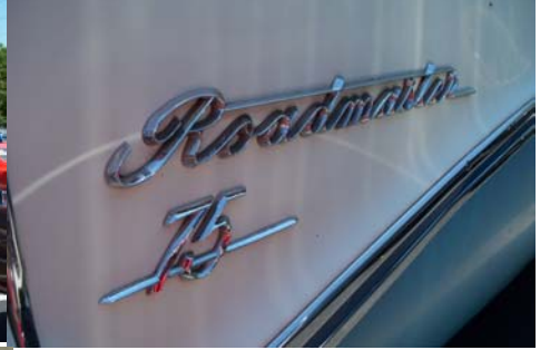
June. Tour Truett Cathy Car Collection