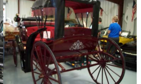
May. "Overnighter" in Washington, GA