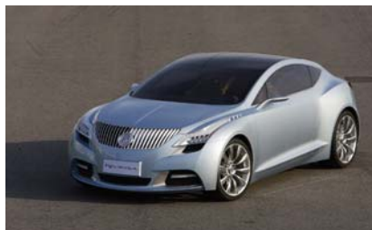
Buick Riviera Concept

That's why we're left wondering what might be sitting up the secretive sleeves in the Buick offices. Winding back to 2007, Buick unveiled a Riviera concept at the Shanghai Motor Show, though it wasn't ever green lit. It made an appearance again in 2008 at the Detroit Auto Show, but has since slipped into the depths of concept car limbo.