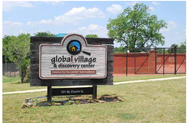
Toured Habitat for Humanity Global Village