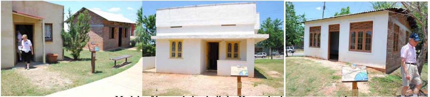
Models of homes being built by Humanity in poorer countries