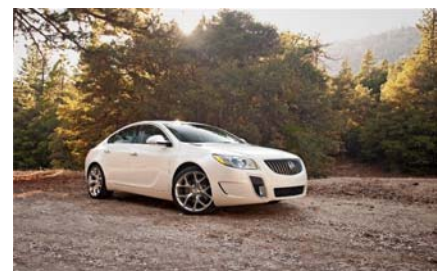
Buick Regal GS