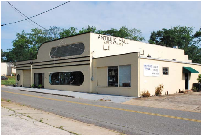
Antique shopping in Thomaston, GA

See more photos of the overnight trip on our Web at www.buickclub.org/dixie