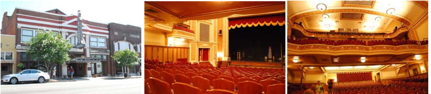
Historic Rylander Theatre. Built in 1921 and served the community well until it closed in 1950. It has recently had a complete restoration and renewal to it's former glory.