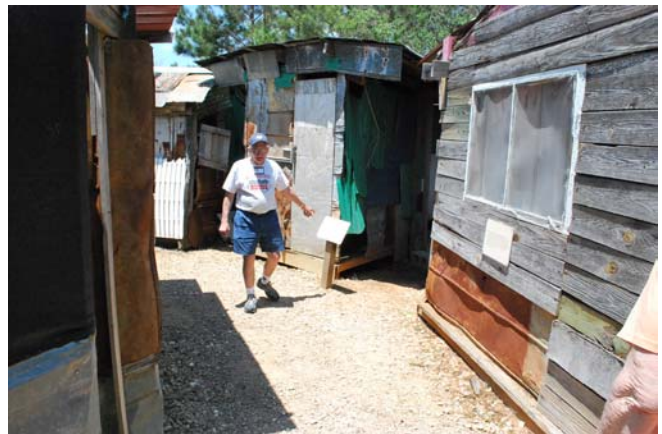
In Global Village, models of slum villages found in poorer countries throughout the world.