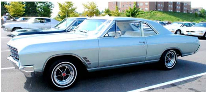
1966 Skylark, Cliff Dillingham