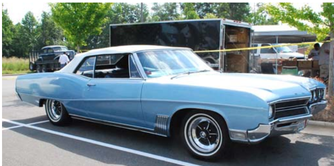
1967 Wildcat, JD & Roxanne Westfall