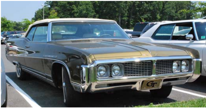
1969 Electra 225, Gus & Rita Valeri