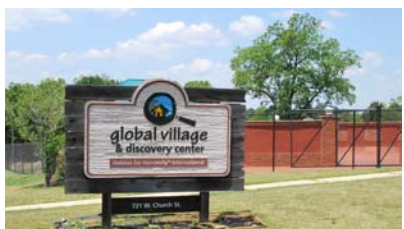
Overnighter to Americus, GA