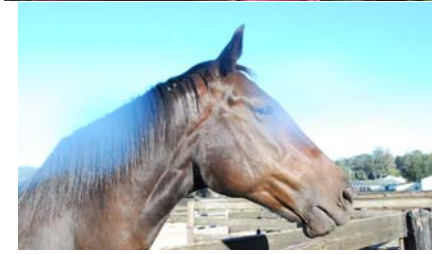
Chasin' A Dream Thoroughbred Farm