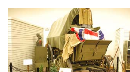
Carriage Museum - One of world's largest