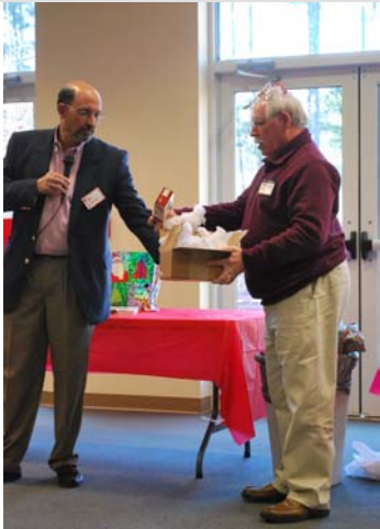
Annual Holiday Party