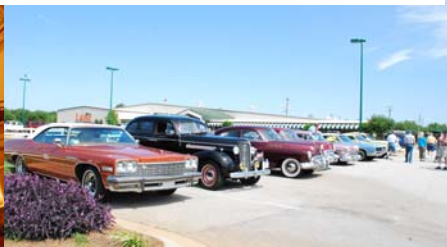
Lane Orchard Store & Restaurant