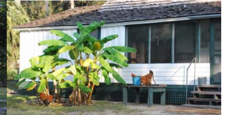
Marjorie K Rawlings Home & State Park: Author, The Yearling