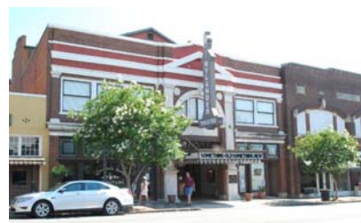
Rylander Theatre ( constructed 1921)