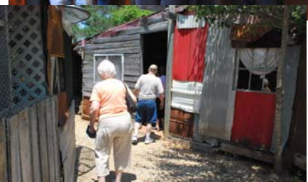
Habitat for Humanities Village