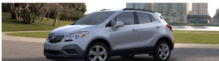
The 2013 Buick Encore