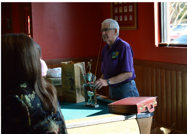
OUR GRATIOUS MASTER OF CEREMONIES