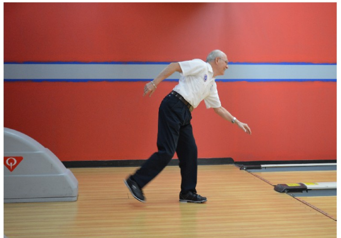
CHECK OUT THAT FORM!