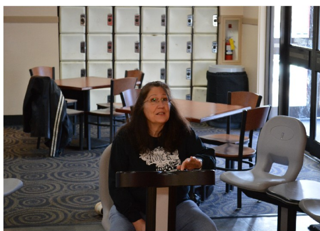
WAIT! HOW MANY GUTTER BALLS?