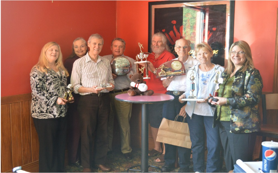
2014 BOWL-A-RAMA WINNERS