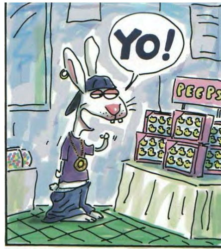
The Easter Bunny at the candy store giving a shout out to his Peeps.

St. Patrick's Day is an enchanted time - a day to begin transforming winter's dreams into summer's magic. -Adrienne Gook