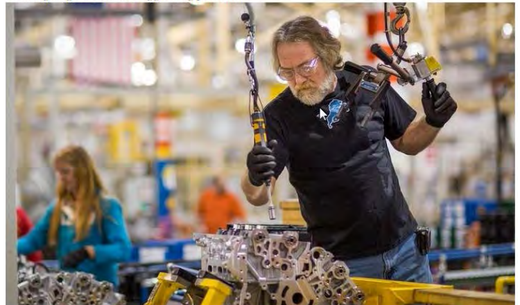
Rusting engine blocks flagged big problem

UAW officials say the water crisis has been a hardship on everyone who works at GM’s plants, whether or not they live in Flint.