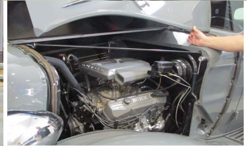
1934 Club Sedan "Resto-Rod"

Dixie Chapter Buicks were also well represented in Woodstock at the D. W. Campbell Car Show. ↴