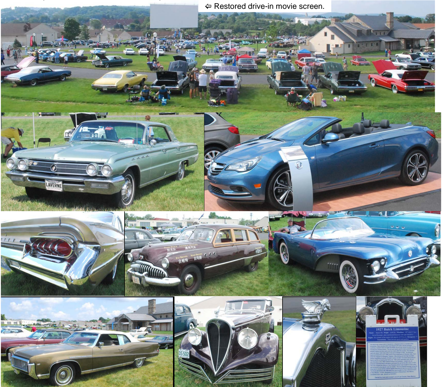
← Restored drive-in movie screen.