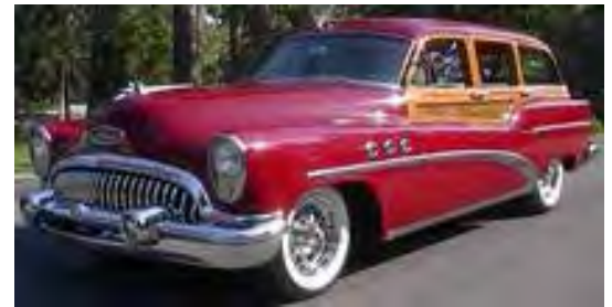
1953 Super Estate Wagon, Model 59

Car Quiz Answer: The Woodye is a 1953 Roadmaster Estate Wagon, Model 79R. The framing was done in seasoned northern ash, with the small panels being mahogany. The "Nailhead" V-8 engine was used in only the Super and Roadmaster models. The Special Series still used the old "Straight 8" engine. Starting in 1954 all series had the V-8. If you like woodies (Who doesn't?), be sure to check out "Woodies USA" online at http://www.woodiesusa.com/index.html