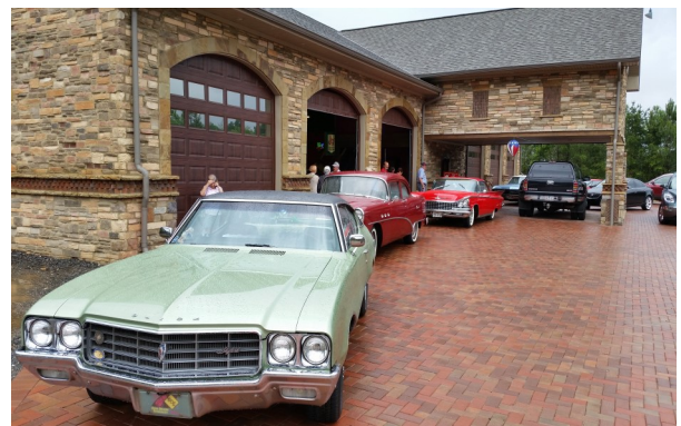
Beautiful Buicks parked in front of Wayne Hollis's auto collection.