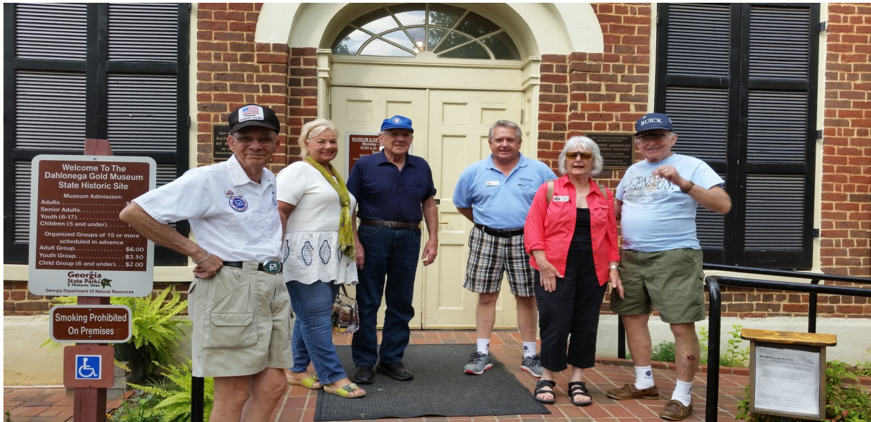
At the Dahlonega Gold Museum