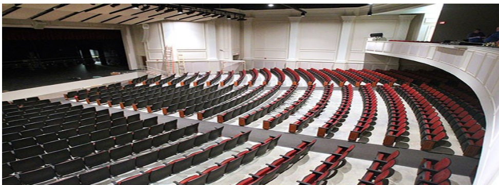
Oxford Performing Arts Center

ture a tour of a rebuilt 1850 home rebuilt to original condition and a tour the Berman Museum of World History and their collection of spy items . Plans also include a tour a Civil War Church. In addition, information will be available about other diverse activities to enjoy. We have blocked sufficient rooms to handle the first 50 Buicks . The rate, including a free breakfast, is $119/night plus tax. Contact John Cover 5425 Caldwell Mill Road Birmingham, AL 35242 for a registration packet that will include hotel contact information. Call 205-991-7106 or email:coverj@asme.org