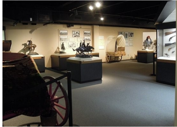
Berman Museum of World History