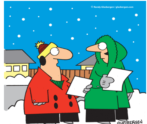
"There's one Christmas carol that's suitable for my voice. The one where the dogs bark Jingle Bells."