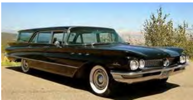
1960 Buick LeSabre Estate Wagon

The Tri-Shield made its debut in the 1960 model year. It was a stylized version of David Dunbar Buick's family crest. Three shields were used to symbolize the three models of Buick that were available in 1960: The Electra, Invicta, and LeSabre.