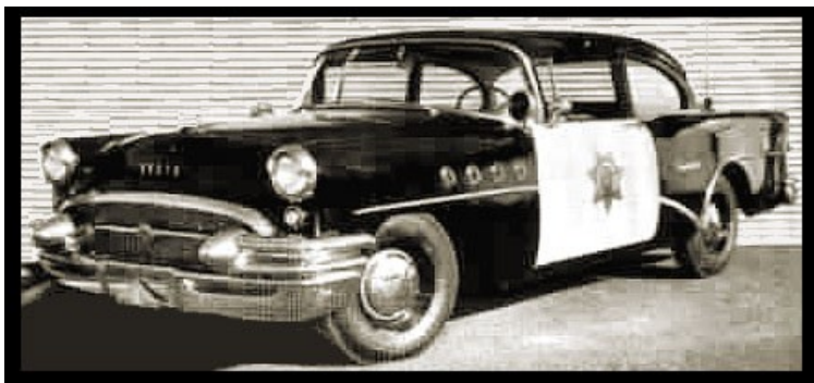
1955 Buick Century Model 68

In 1955 Buick produced 270 Century Model 68 two door sedans for the California Highway Patrol. Each equipped with the venerable 322 cubic inch Nailhead V/8. They were split evenly at 135 a piece Dynaflo and three speed column shift transmissions.