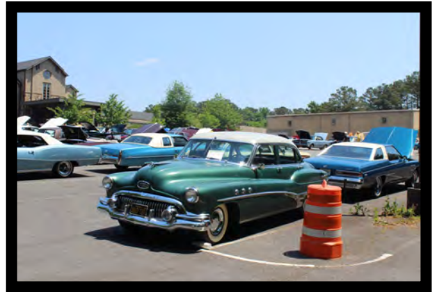
Bill Eisenhardt's Super