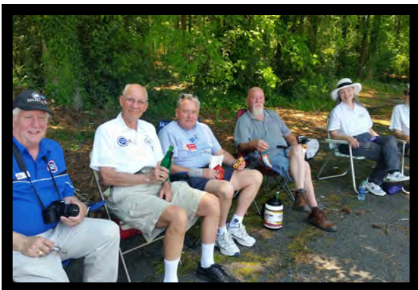
Shadiest spot on the show field