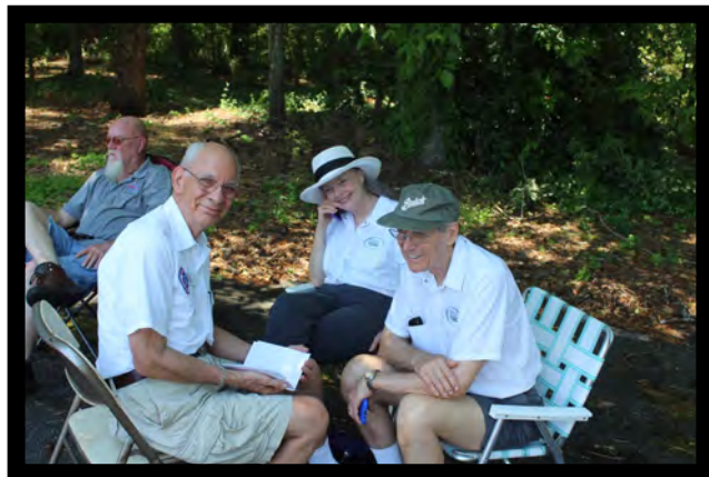
Dixie Chapter folks enjoying a shady spot.