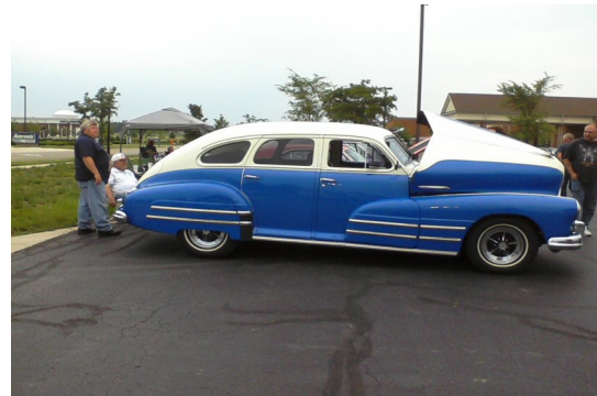
1947 Special Fastback Resto-rod. Owned by J.D. Westfall