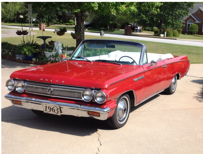
1963 Skylark. Owned by Ernie & Susie Grant