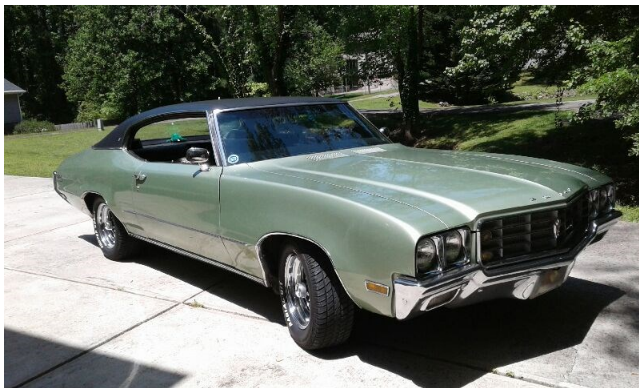
1970 Skylark. Owned by Bruce & Shar Kile