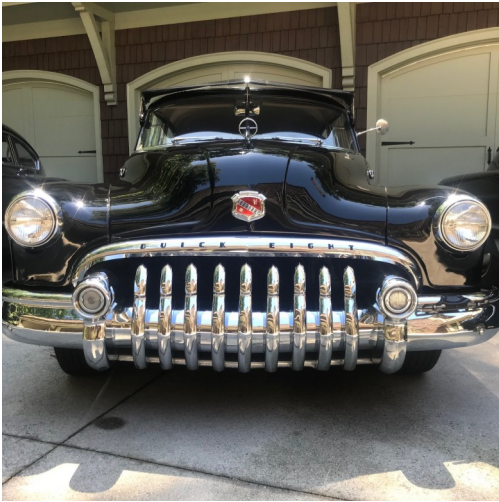
1950 Super 56 S . Owner Alan Lisenby