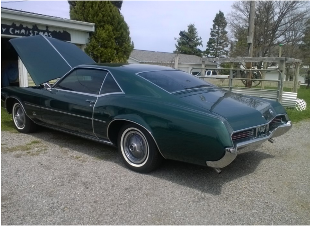
1967 Riviera. Owned by J.D. Westfall