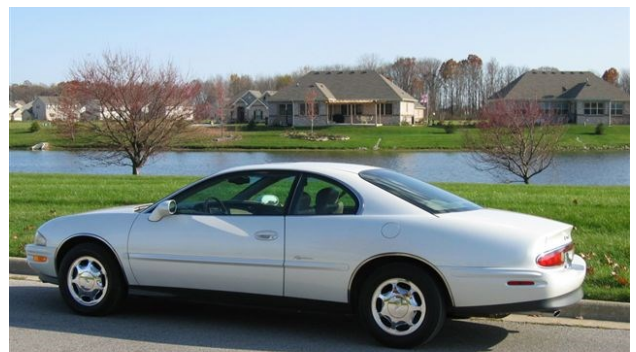
1990 Riviera. Owned by Roy Newby