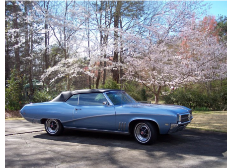
1969 skylark Custom Convertible. Owned by Glenn & Debbie Novak