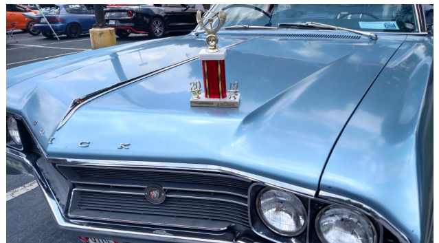
1967 Wildcat Convertible. Owned by J.D. Westfall