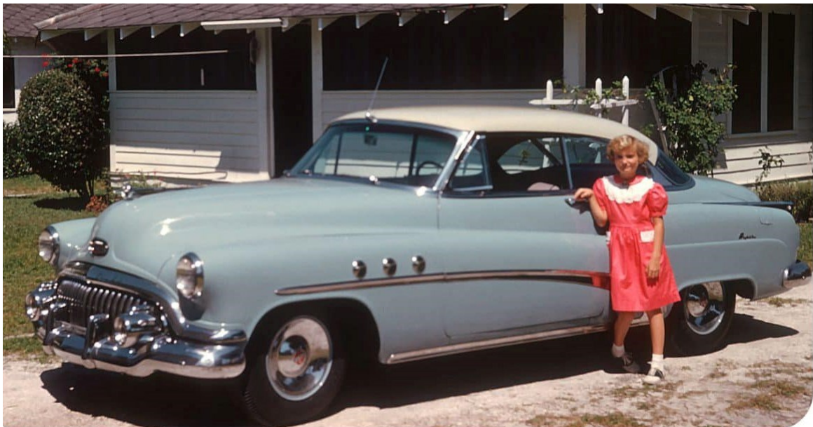
Kodachrome wasn't only good for capturing sunny days and the greens of Summer, but also for bringing this Mid-Century image of a smiling Buick and sweet girl in a Little Orphan Annie dress to life.